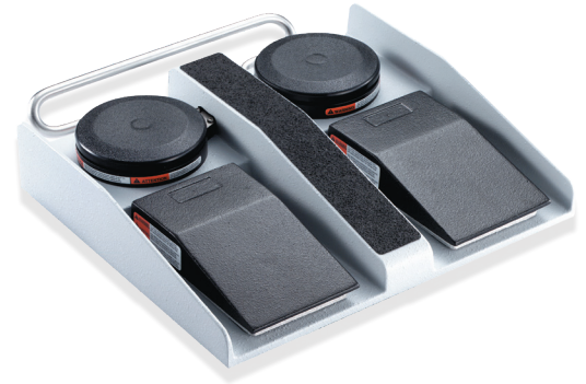
CUSTOM VARIATION WITH DOLPHIN SWITCHES SHOWN