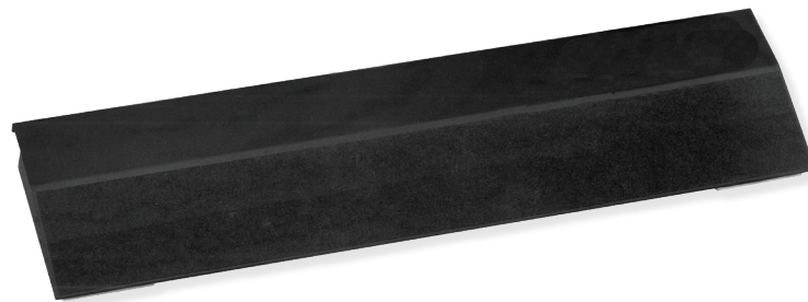
CUSTOM WIDE PEDAL VARIATIONS FOR AIR TRAFFIC CONTROL COMMUNICATION EQUIPMENT